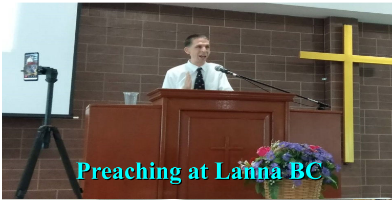
Preaching at Lanna BC