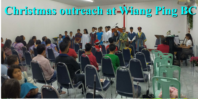
Christmas outreach at Wiang Ping BC