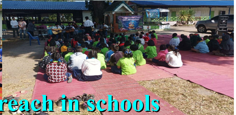
Christmas outreach in schools