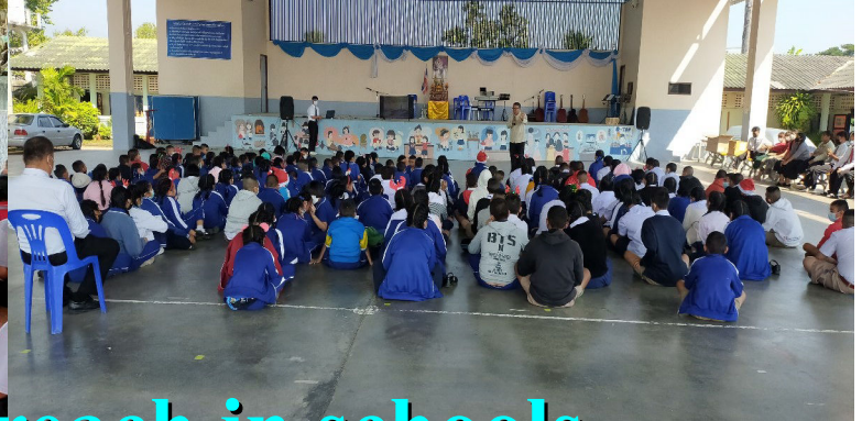
Christmas outreach in schools