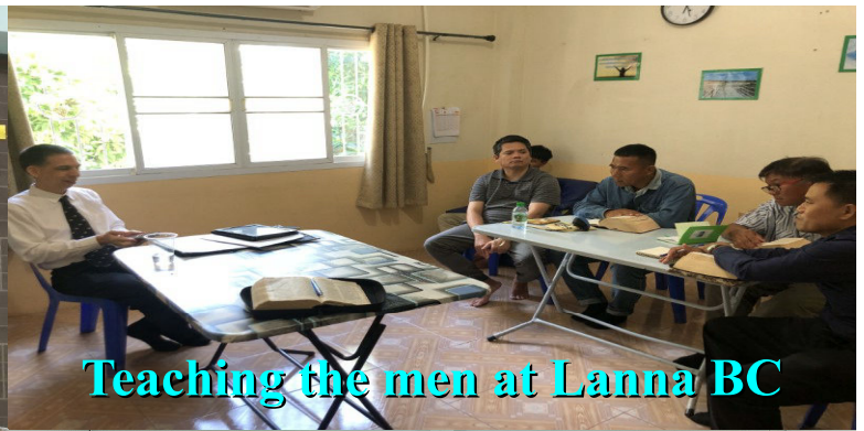
Teaching the men at Lanna BC