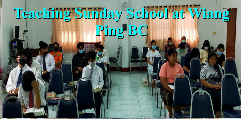
Teaching Sunday School at Wiang Ping BC